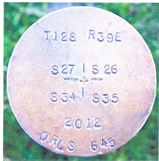
Brass Cap as stamped.

This section corners true geographic position. 44°30'129.99809"N 117°53'28.10145"W NAD83