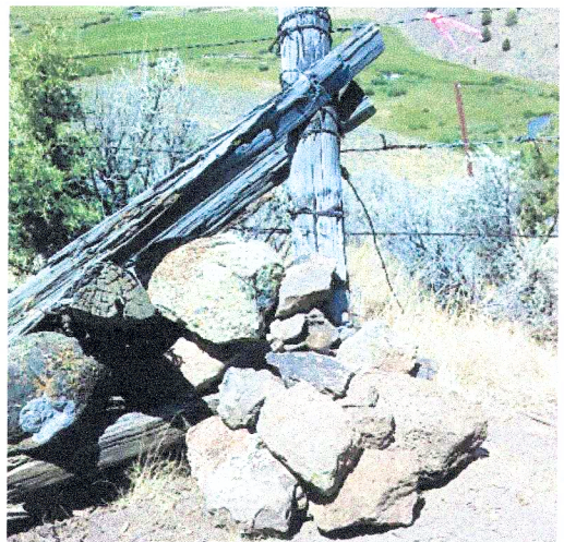
Set brass cap monument to within 8" of the surface in a mound of stone 3 feet at base around monument. Original stone is buried on the West side of monument.