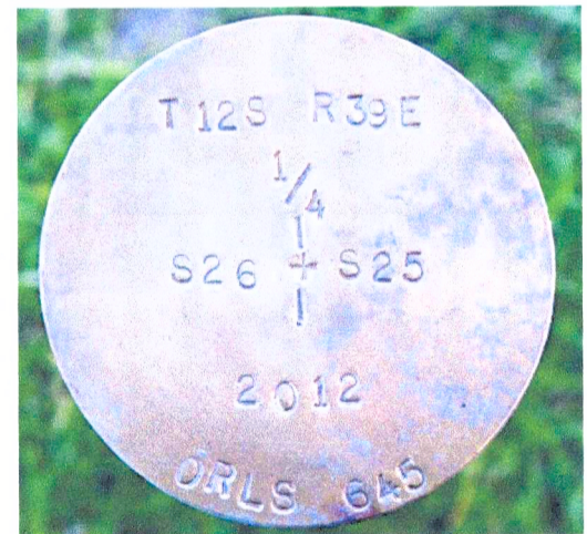
Brass Cap as stamped.

Reference No. 4 is a 5/8" x 30" iron rebar with an orange plastic cap stamped Reference Monument which bears West, 15.00 feet distance and in direct line with bearing object No. 3. Monument pin was driven to within 6 inches above the ground surface.