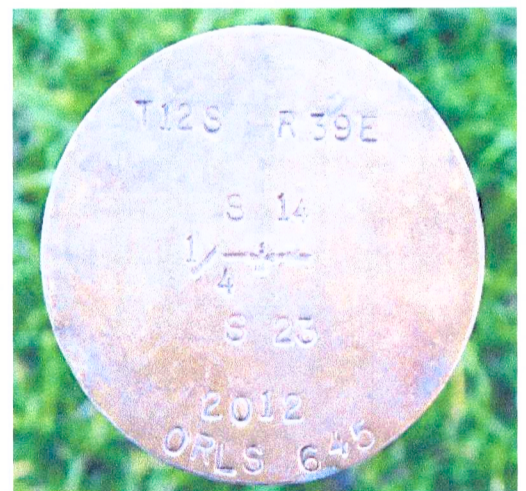
Brass Cap as stamped.

This 1/4 corners true geographic position. 44° 30' 55.52362" N, 117° 54' 4.16942" W NAD83