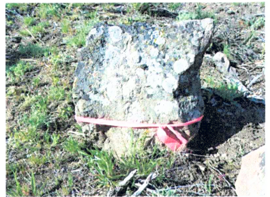
Found a Basalt stone 24" x 16" x 16" in place and marked 1/4 on the North face, as described by Reuben R. Leigh. Notice the large marks 1/4 being visible in the photo.

At the location of this one quarter corner I found a large Basalt stone measuring 24" x 16" x 16" as shown in the accompanying photo, of which fits the description of the stone Reuben R. Leigh said he had set. Stone is marked 1/4 on the North face with a small mound of stone alongside.