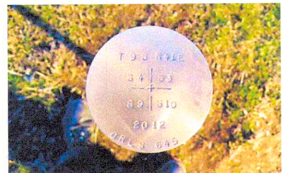
Brass Cap as stamped.

This Section corners handheld GPS geographic position. 44° 48' 11.820" N, 117° 41' 9.360" W NAD83.