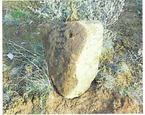
At this Section Corner location I found a marked Basalt stone that measures 14"x 13"x 6" closely agreeing as described in W. B. Barr's field notes. Notice the markings 5 notches on the South and 3 notches on the East faces as I have highlighted using a black lumber marker to out line the clearly visible chisel marks.

I, James H. Hambleton certify that this corner was properly reestablished as witnessed by John Eggers on December 7, 2012.